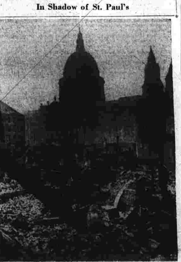
Members of the Pioneer Corps clear away debris of London buildings which were so severely damaged by German air attacks that they were unsafe. In the background is the famous St. Paul's cathedral which escaped severe damage.

3,000,000 Racing Pigeons May Get Caught in Draft Los Angeles, April 17.—(AP)—Like doughboys and gobs, 3,000,000 of the nation's racing pigeons soon may get caught in the draft.